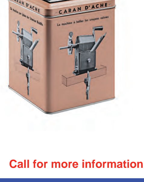
The Essence of Swiss Pencils by Caran d'AcheSwiss forests