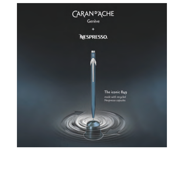
Call for more information

In collaboration with Nespresso, Caran d'Ache is presenting a new 849 ballpoint pen in limited edition