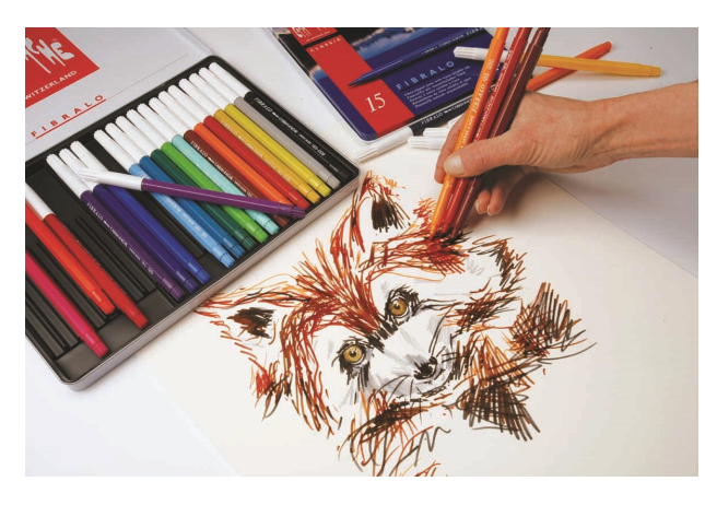
Bundle 3 or 4 Fibralo marker pens together and draw lines or dots. Then mist with water and change the colors with a wet brush. This will dissolve the colors and make them even more intense.